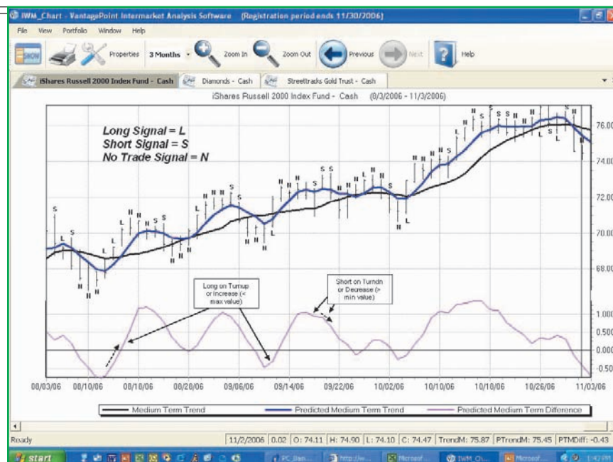
FIGURE 3: PREDICTED VS. ACTUAL TREND. Here you see how the spread between the predicted and actual trend generates trading signals.

VantagePoint 7.0 provides accurate short-term forecast data across many markets. Accurate forecasts are difficult to de-